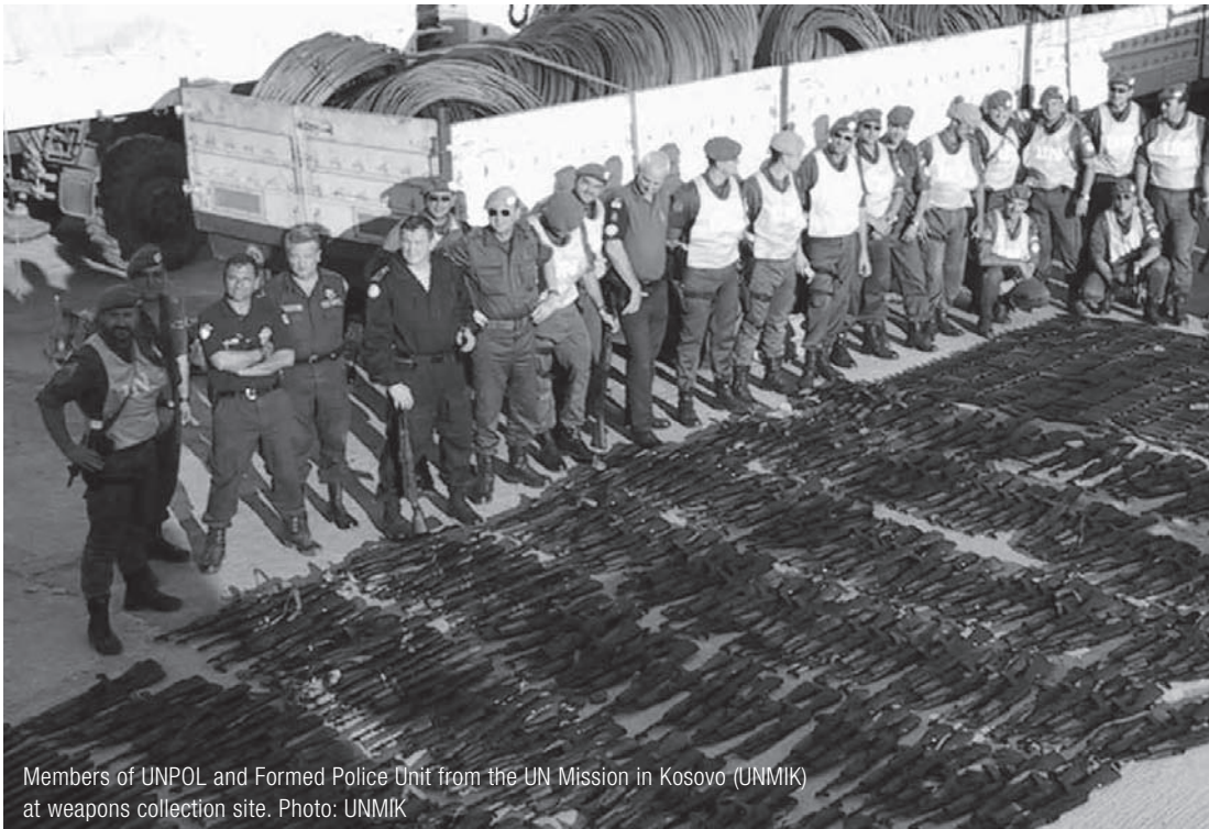
Members of UNPOL and Formed Police Unit from the UN Mission in Kosovo (UNMIK) at weapons collection site.

Another important aspect of coordination is ensuring the safety and security of demobilization camps and other sites where the gathering of large numbers of former combatants might cause potential security risks. UNPOL can effectively coordinate security arrangements that reassure ex-combatants trying to return to normal civilian life. Demobilization camp security, on the other hand, shall be the responsibility of the military component of the mission.