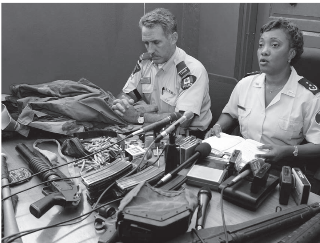
Haitian National Police (PNH) spokeswoman and UNPOL spokesman during press conference at PNH station in Delmas 33 in Port-au-Prince with weapons, ammunition and uniforms (both ex-FADH and PNH) that were seized over the weekend in two joint UNPOL–PNH operations.

A Security Council resolution provides the legal basis for the establishment of a mission. The specific tasks of the related components of such a mission are often well defined and form the basis for the concept of operations. With the deployment of UNPOL to the mission area, the UNPOL Commissioner will (depending on the size of the UNPOL component and its mandate) establish a dedicated DDR coordinating unit with a liaison officer who will work very closely with the mission's DDR command structures in order to coordinate activity with military, national police services, the UN Development Programme and other relevant agencies involved in DDR programmes.