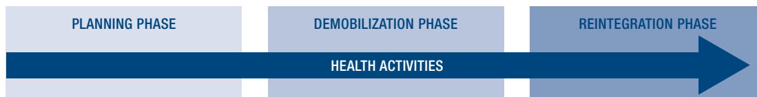
Figure 1 DDR: The importance of health activities in the different phases of the process

Figure 1 provides a simplified image of the general direction in which the health sector has to move to best support a DDR process. Clearly, health actions set up to meet the specific needs of the demobilization phase, which will only last for a short period of time, must be planned as only the first steps of a longer-term, open-ended and comprehensive reintegration process. In what follows, some of the factors that will help the achievement of this long-term goal are outlined.